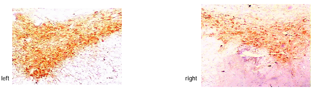
6-OHDA-treated group: The number of TH-positive neurons and the percentage of positive cells with intact dendrites on the right were less than those on the left.