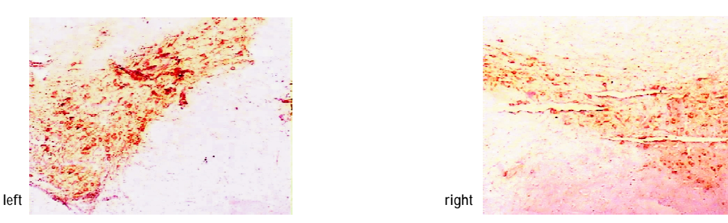
Hcy-treated group: The number of TH-positive neurons and the percentage of positive cells with intact dendrites on the right were approximately equal with those on the left.